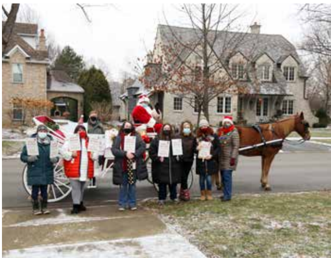
Staff walked with Santa and Cody the Horse from Candlelight Horse & Carriage.

“Thank you for helping to make a tough year so enjoyable for my kids with all your incredible ideas. We moved here in November and have loved everything that you’ve offered from the story telling, gingerbread house, mystery bag and steam kits.”