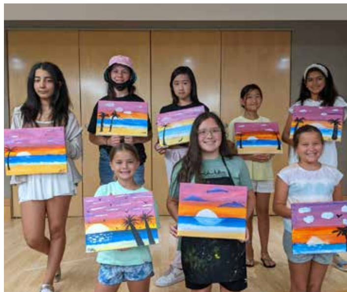
Finished products from July's Teen Paint & Snack!

This program is for high school students only; come prepared for fright! We will be working in teams of up to 4. Each team member must sign up separately. Space is limited.