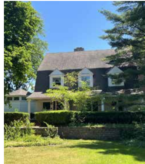
Frank Lloyd Wright's Bagley House